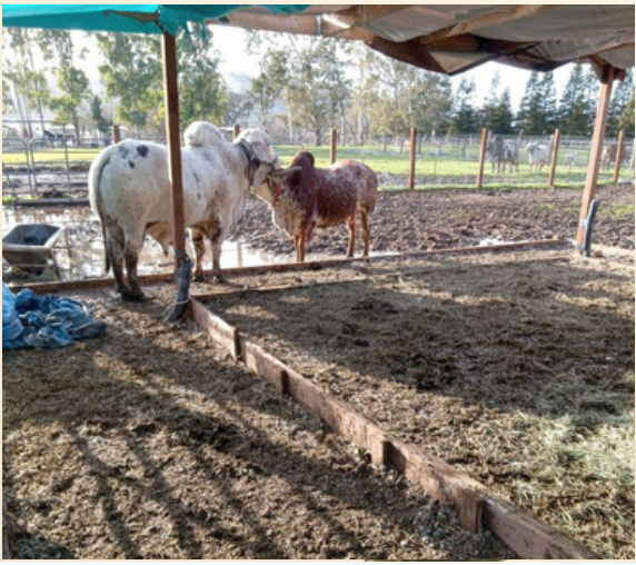
Cows reviewing the raised beds.