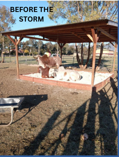
BEFORE THE STORM

Besides infections, goshala residents were challenged by Rainstorms in December. Measures were taken to drain out standing water that had accumulated in the cows' living space during storms. In order to combat the ongoing flooding problem, another 1075 SqFt raised area was built right next to the sandbox. This ensured that four-legged residents had refuge on raised beds during heavy rains with a safe and dry place to be while they rest or eat their food. After a few weeks of hard work, the drainage pipes got installed to prevent future flooding and just in time for the next storm to hit. The cows' raised feeding ground helped to prevent issues with standing water.