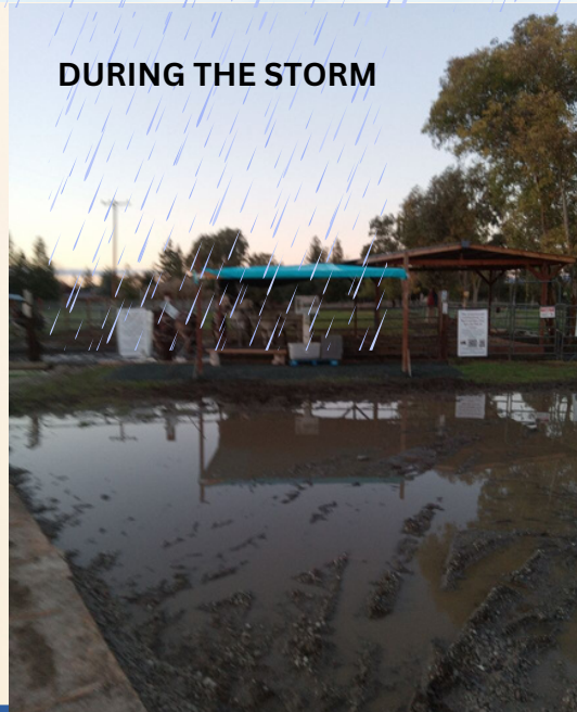
DURING THE STORM