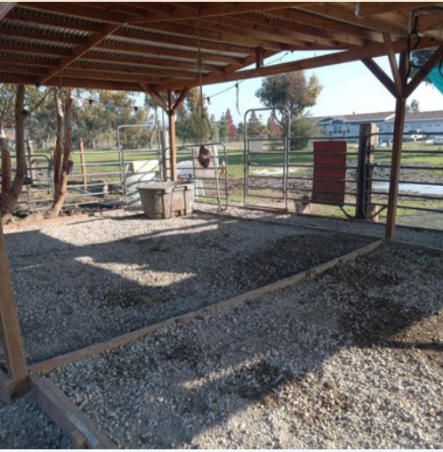
Raised beds built during Storm