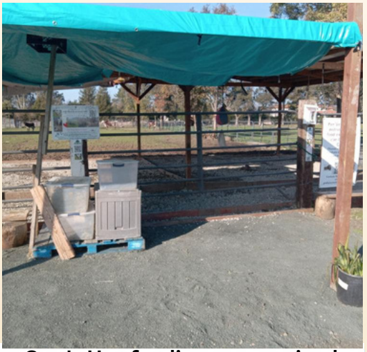
Cow's Hay feeding area revived during storms

We are seeking volunteers to help support our research team remotely. If you can spare an hour or few in a week, one time or monthly, please email us at : goshalacowfood@gmail.com All research work is done remotely!