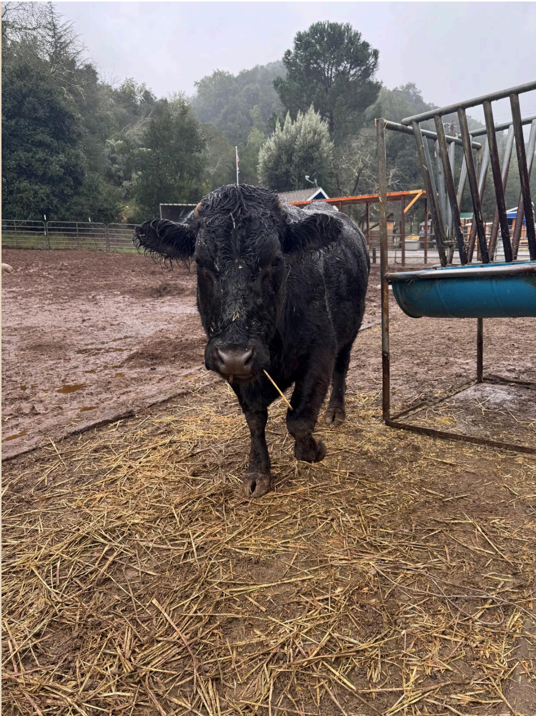
Cows are happy and relieved from flooded corral.